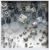
Tower packings for mass and heat transfer