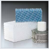
Structured packings for mass and heat transfer