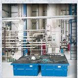
Ammonia recovery processes