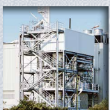
Combustion plants for the disposal of exhaust air, waste gases and liquid media