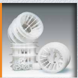
Biological carrier media