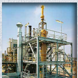
Turn-key units for waste gas scrubbing